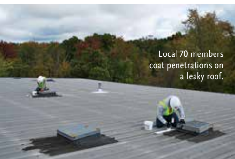
Local 70 members coat penetrations on a leaky roof.