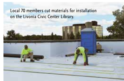
Local 70 members cut materials for installation on the Livonia Civic Center Library.