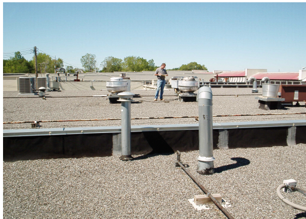
CEI Group International Hamburg, Michigan

Built on integrity...Growing Through Service and Reliability